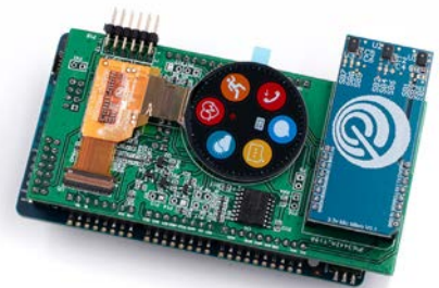
Apollo4 Plus Graphical Display