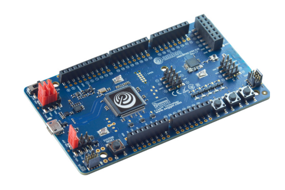
Apollo3 Blue AMA3BEVB (EVB)