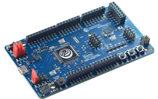
Apollo3 Blue AMA3BEVB (EVB)

The Apollo3 Blue brings several new features to Ambiq's SPOT-based Apollo SoC including an integrated DMA engine, QSPI interface, and advanced stepper motor control for ultra-low power analog watch hand management. With unprecedented energy efficiency and PDM microphone inputs, the Apollo3 Blue also forms the core of Ambiq's Voice-on-SPOT ® reference platform making it the perfect device for customers who want to add always-on voice assistant integration and command recognition to battery-powered devices. To increase design flexibility and enable connections to the phone and cloud, the Apollo3 Blue provides a dedicated second core for the ultra-low power Bluetooth Low Energy 5 connectivity platform providing superior RF throughput and leaving plenty of resources available for user applications.