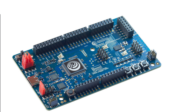
Apollo3 Blue Plus AMA3B2EVB (EVB)