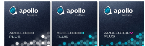
Apollo330 Plus, Apollo330B Plus, and Apollo330M Plus 1

Innovative secureSPOT® 3.0 features based on TrustZone® technology further enhance Apollo330 Plus Series SoCs, ensuring the integrity and confidentiality of data transmitted and processed by connected devices. With hardware-based security mechanisms such as secure boot and secure firmware updates, these SoCs provides robust protection against unauthorized access and malicious attacks, enabling secure deployment in various applications.