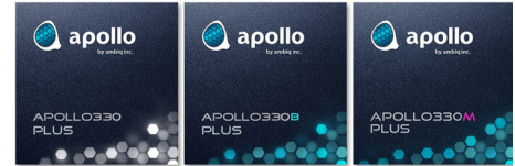
Apollo330 Plus, Apollo330B Plus, and Apollo330M Plus 1

Innovative secureSPOT® 3.0 features based on TrustZone® technology further enhance Apollo330 Plus Series SoCs, ensuring the integrity and confidentiality of data transmitted and processed by connected devices. With hardware-based security mechanisms such as secure boot and secure firmware updates, these SoCs provides robust protection against unauthorized access and malicious attacks, enabling secure deployment in various applications.